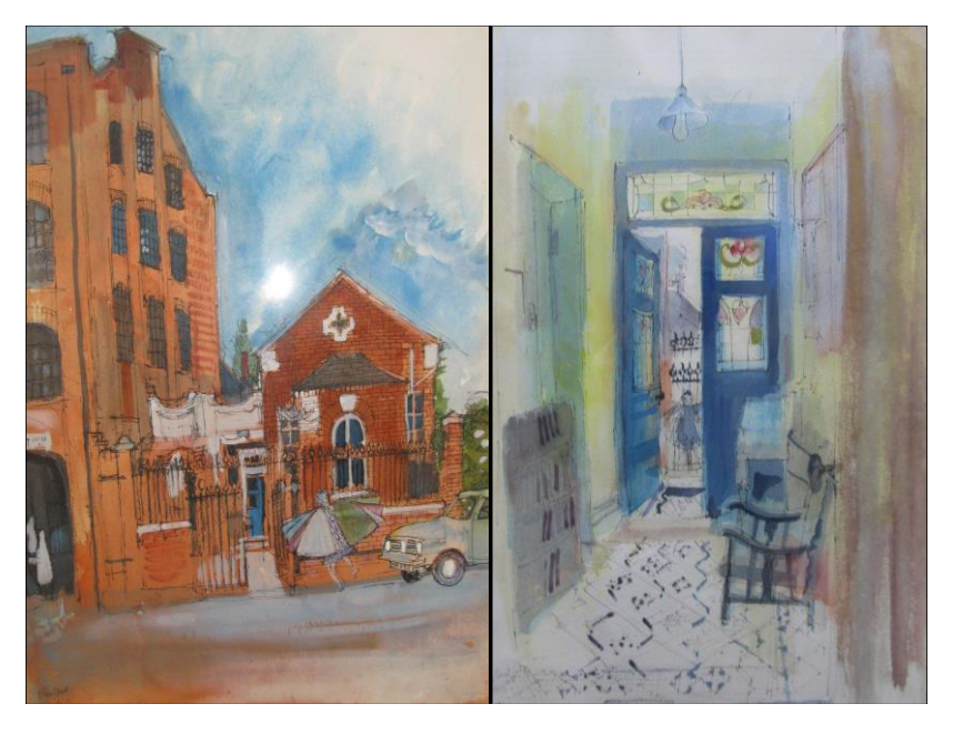
Fig.2 Paintings of the exterior and interior of the meeting house c1980 by Nina Carroll (from originals in the building).